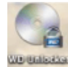
Macintosh OS 10.5+